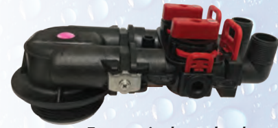
90° 3/4" NPT Elbows

Economical non-back-washing distribution head with convenient quick connect fittings